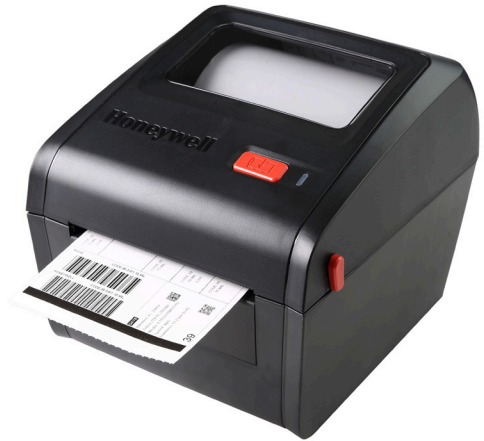
A powerful and reliable desktop printer, the PC42d printer is well suited for a variety of low-to-mid intensity thermal printing applications.

With a high-quality print head, advanced thermal management algorithms and broad thermal media compatibility, the PC42d printer delivers excellent printing results in an affordable, dependable desktop printer.