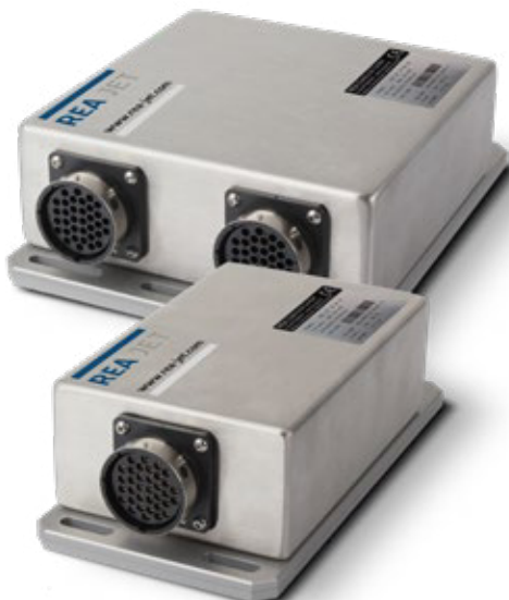
DOD 2.0 – Print head Control units Top: 32 nozzles, bottom: 7/16 nozzles