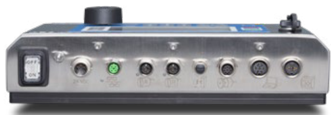
Rear view DOD 2.0 Control terminal – port panel