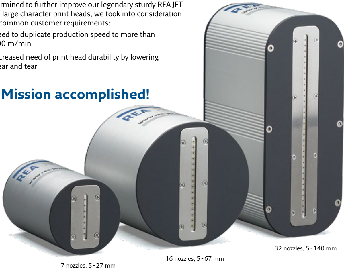
7 nozzles, 5 - 27 mm