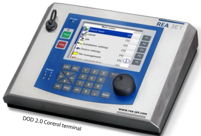
DOD 2.0 Control terminal