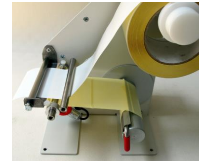
Label Threading Path

OPTIONAL LABEL COUNTER: The optional Label Counter will add one count to the displayed number for each label that is dispensed. This Option is available only factory installed in new units.