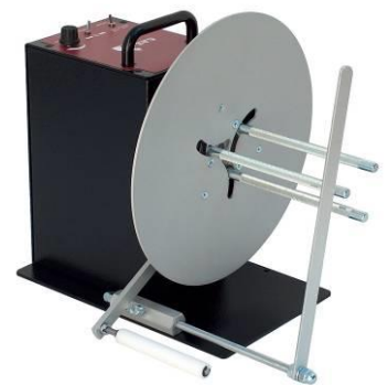
CAT-3-TA-ACH with APG

keep the unit from moving. The CAT-3 handles any rewind job and with its "HIGH" torque range can also power the LABELMATE S-100 or S-200 Label Slitters. Reliable, high quality and maintenance-free.